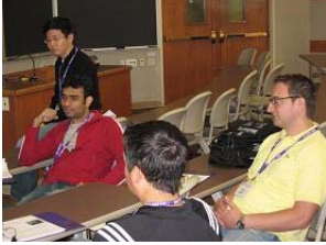
Snapshots from Orientation