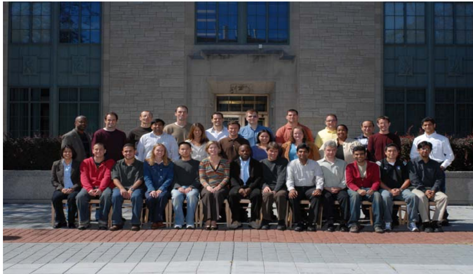
MSIT Class of 2009